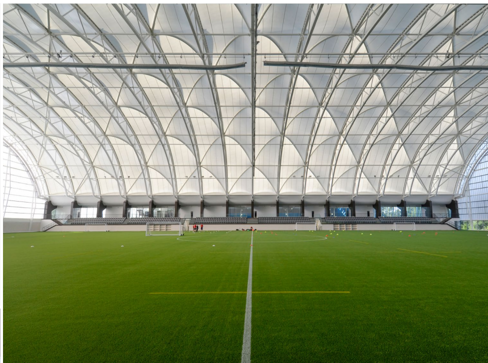
ORIAM © Reich and Hall